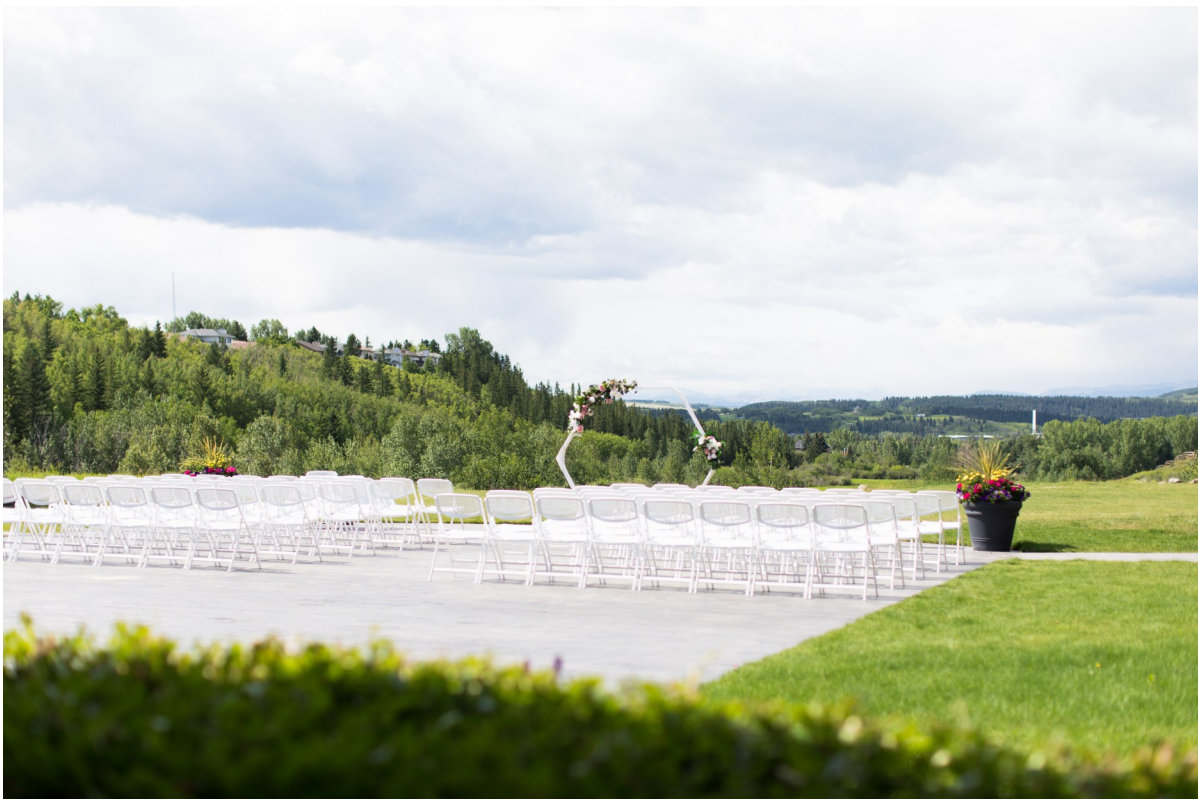
Arch : Chair Flair, Arch Florals: Creative Edge Flowers

We do not host ceremonies and receptions in the same room.